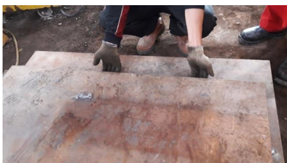
Picture 1. Hand position of the informant that is pinned by sharp iron plates

"It was my time in the construction I lifted the plate, hah is exactly rich like this (like this) for example (show plates)... I already pake (wearing) hand shirts have pake (already wearing a hand shirt), anyway when it has pake (already wearing a hand shirt), I want to lift this plate two people (plates appointed by the main informant and a worker) from the one guns Say already ready yet because (because) the position is still like this (as shown) (while showing the position of the hand that is not ready to lift) "