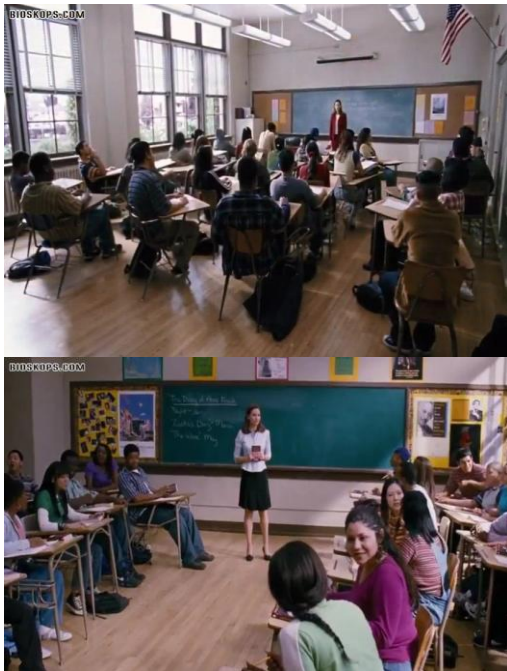
Picture 1. Classroom management