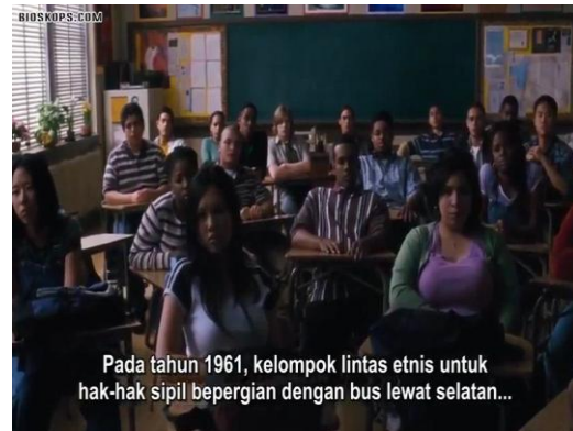
Picture 4. Watching documentary film