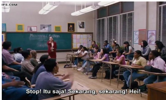
Picture 3. Group Debate